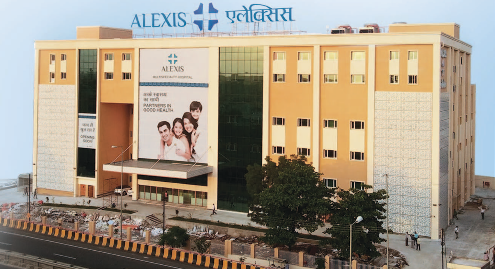
ALEXIS HOSPITAL, NAGPUR