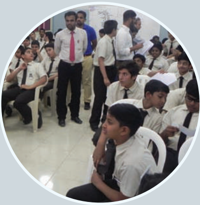
Health Talk & basic eye check-up at Al Sabah Indian Private School, Dhaid