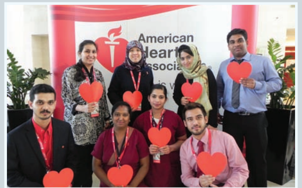
Zulekha Hospital supported- American Heart Association Go Red Event at Healthcare City, Dubai