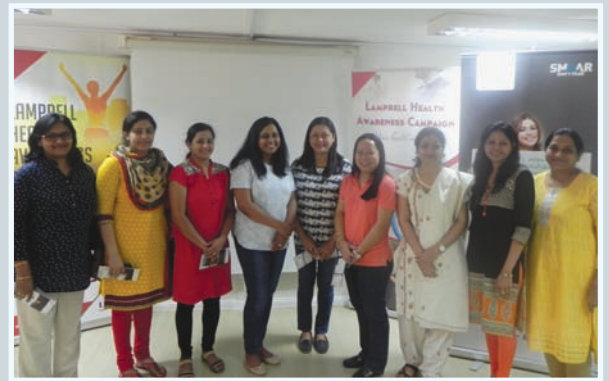
Cervical Cancer Awareness Talk at Lamprell - Port Khalid, Sharjah