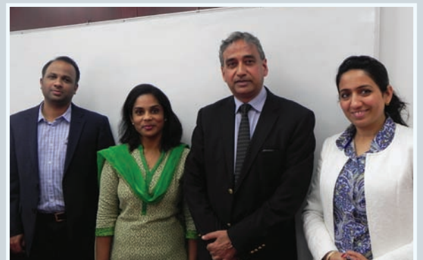
Health Awareness Session on Diabetes Mellitus at Bhatia Brothers, Dubai