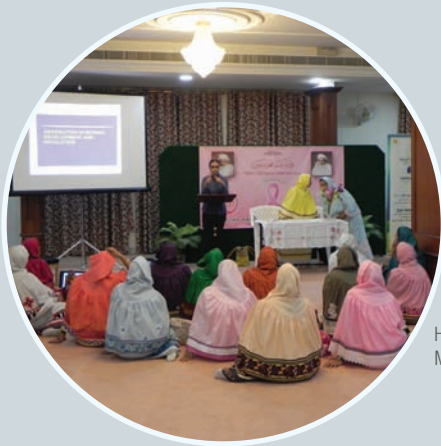
Health Talk at Bohra Community Mosque, Ajman