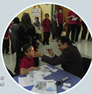
Health Talk & basic eye check-up at Al Dhaid Private School