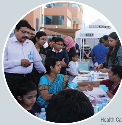
Health Camp at Gulf Madhyamam Educational and Career Exhibition