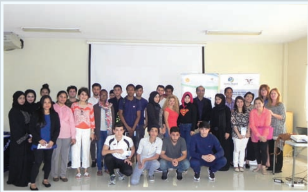
Lasik Awareness Session at American College of Dubai