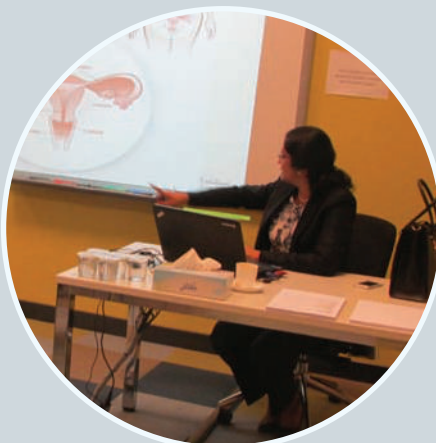
Cervical Cancer Awareness at Sciencetech, Dubai