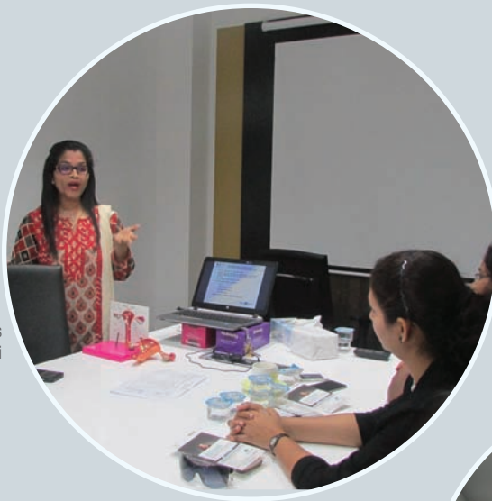
Cervical Cancer Awareness at Al Naboodah, Dubai