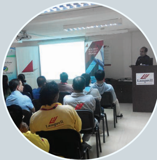
Health Talk at Lamprell Hamiryah Freezone, Sharjah