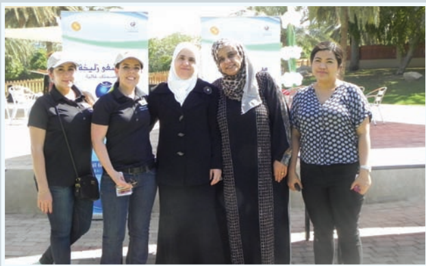
Health Awareness Session at Sharjah Investment & Development Authority (Shurooq)