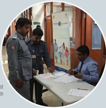
Cardiology Camp at Emirates Driving Institute