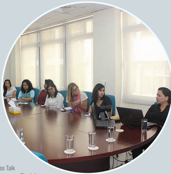
Cervical Cancer Awareness Talk at Sharaf Aviation Academy & Al Sharaf General Contracting Company