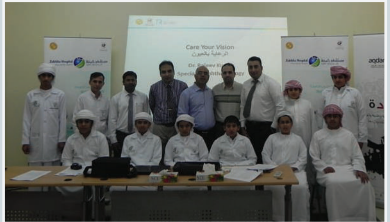
Basic eye checkup at Al Weshah School, Dhaid