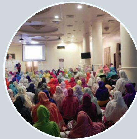
Health Talk on skin care at Burhani Masjid, Sharjah