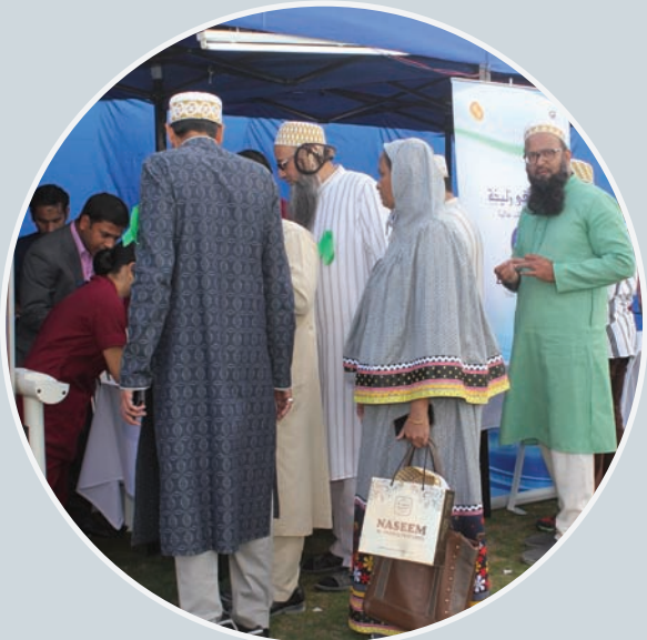
Medical Checkup Camp for Bohra Community at Al Madina Cricket Stadium