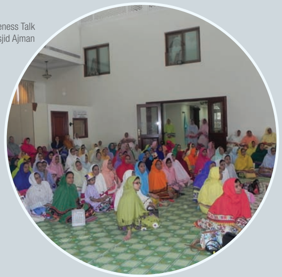
Cervical Cancer Awareness Talk at Anjuman-E-Najmi Masjid Ajman