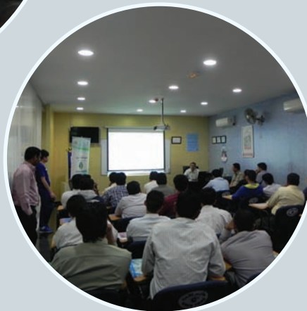
Health Awareness Talk about Cancer for Cars Taxi office staffs on 26 January, 2016