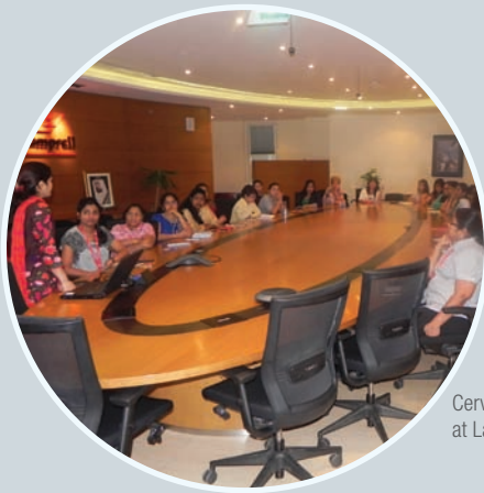
Cervical Cancer Awareness Talk at Lamprell - Hamriyah Freezone, Sharjah