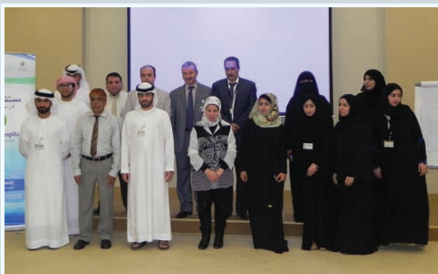
Cancer Awareness Session at Municipality of Sharjah