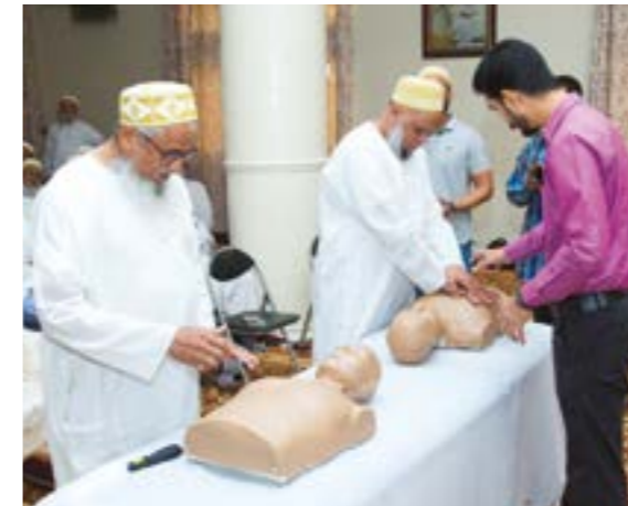
Burhani Mosque, Sharjah