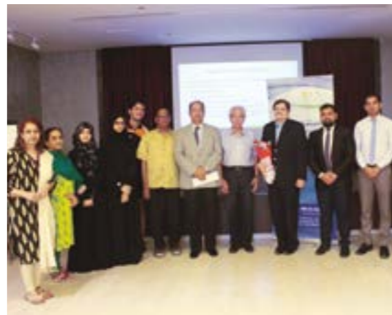
INDIA CLUB, DUBAI Topic: 'Digital World - Family Strategy'