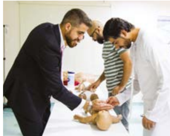
Zulekha Hospital, Sharjah