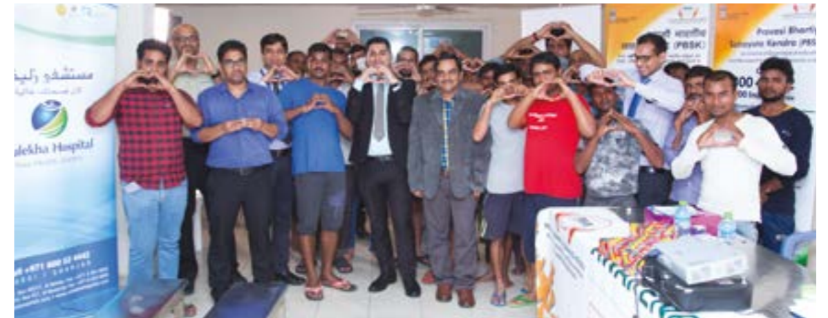
(L&T) in Association with Pravasi Bharatiya Sahayata Kendra (PBSK)