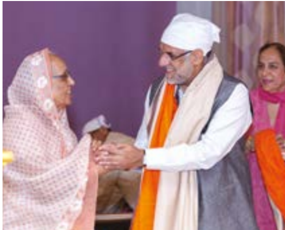
Gurunanak Darbar Gurudwara, Dubai

Cardiac arrest remains the leading cause of mortality across the world. And according to a recent study, 70% of cardiac arrests happen in homes or at workplaces. Cardiopulmonary resuscitation (CPR) is the key to survival in such situations. As part of our 'Save Hearts' initiative which aims to increase the chances of survival of cardiac arrest victims, Zulekha Hospital hosted CPR awareness sessions at various corporates across UAE. The sessions educated the participants on how one can identify a cardiac arrest and be a first responder in emergencies. The employees were trained in CPR and informed about the importance of CPR as a life-saving skill. The community members expressed their sincere thanks and gratitude for the efforts in spreading awareness about cardiac emergencies; and educating the masses on how to give basic life support, in time of need.