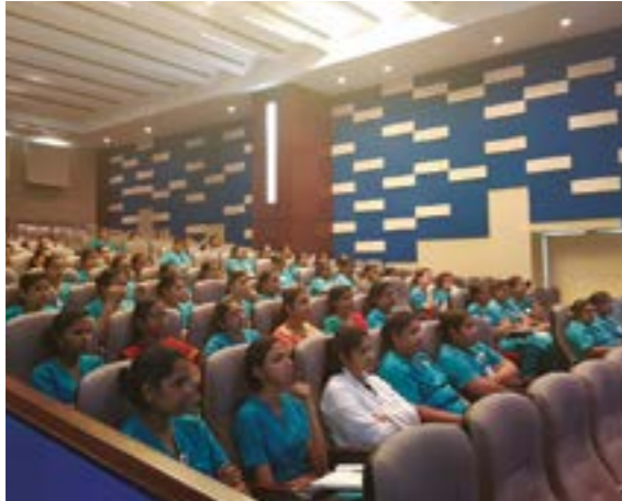
CNE SESSION FOR THE NURSING STAFF Topic: 'Positive Discipline: What can we do better as parents?'