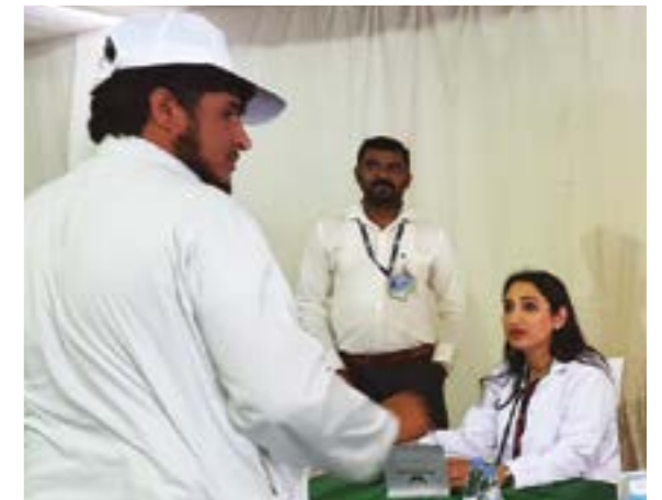
Sharjah Charity International