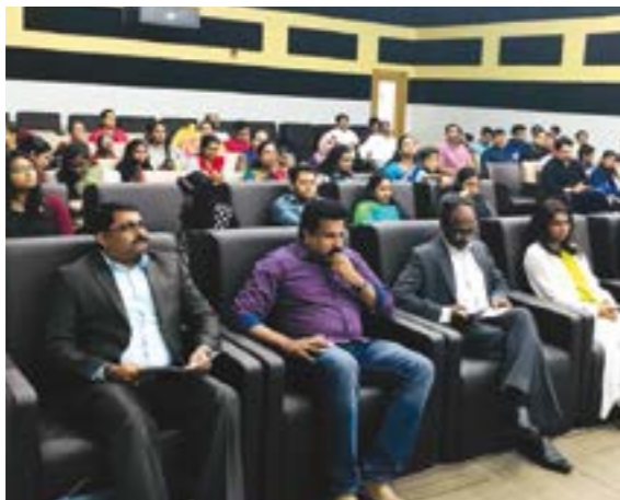
SANTHWANAM AT ZULEKHA HOSPITAL Topic: 'Exams - How to prepare well, and beat exam-stress?'