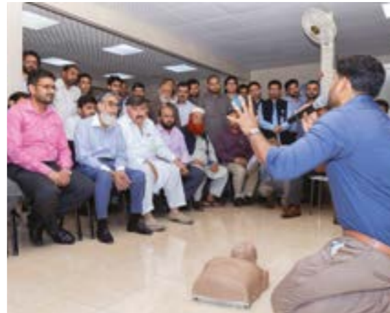
The Consulate Of Pakistan In Dubai