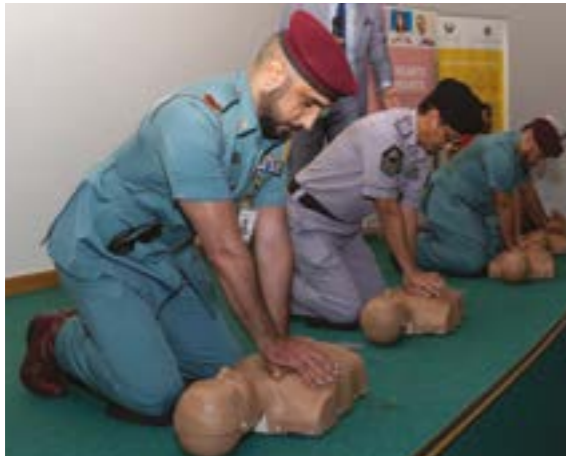
Sharjah Police Headquarters