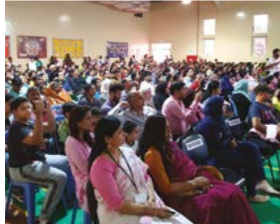
LEADERS PVT. SCHOOL, SHARJAH Topic: Common parenting errors and their long-term negative impact on health and lifestyle.