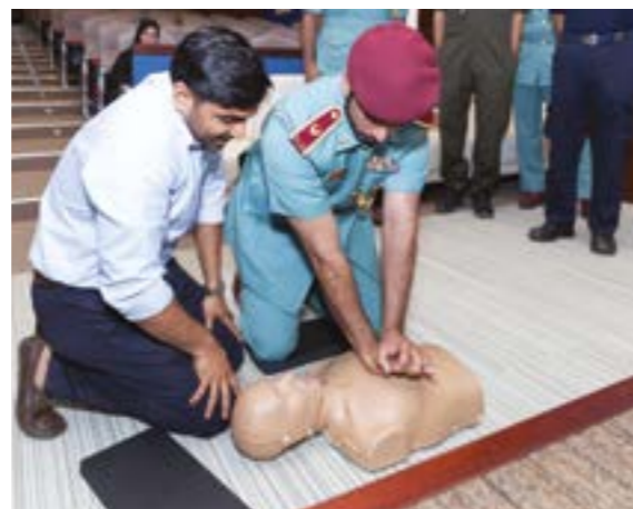
Sharjah Civil Defense