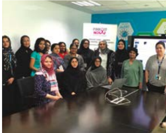
Emirates NBD Bank

Zulekha Hospital hosted awareness talks and wellness workshops at various corporate premises, throughout October. Our specialists, educated the corporates on topics covering early detection and prevention of breast cancer, breastfeeding myths. We also conducted various mental health awareness sessions encouraging people to speak up and take the next step towards creating happy minds and also on the management and prevention of heart diseases. Over the sessions, exclusive discounted services and free screenings were offered to the patrons. The corporate engagements during October included MAF Finance, STS, Transguard, Civil Defense Dubai, Dubai Corporation for Ambulance Services, Dubai Properties, Landmark Group, Santhwanam, BCI Group, AWRostamani, ENOC, Emirates NBD Bank, Sharjah Aviation, Al Saleh Private School, Dufry Sharjah, Bee'ah, Novotel and Sharjah Charity International.