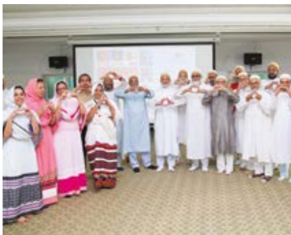
Burhani Mosque, Dubai