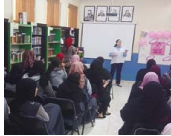
Al Saleh Private School