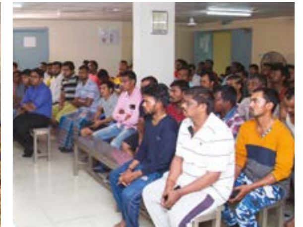
Precision Plastic Products LLC, Dubai in Association with Pravasi Bharatiya Sahayata Kendra (PBSK)