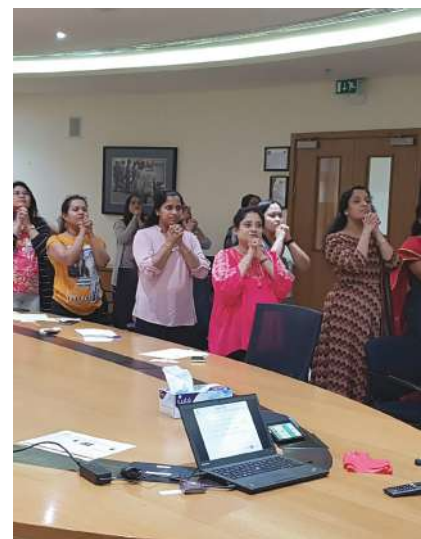
April: Lamprell – Port Khalid, Sharjah