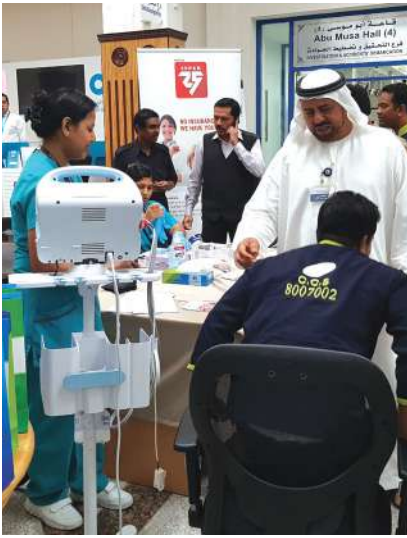
April: Sharjah Police