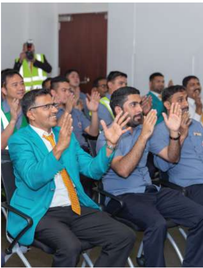
April: Dubai Duty Free