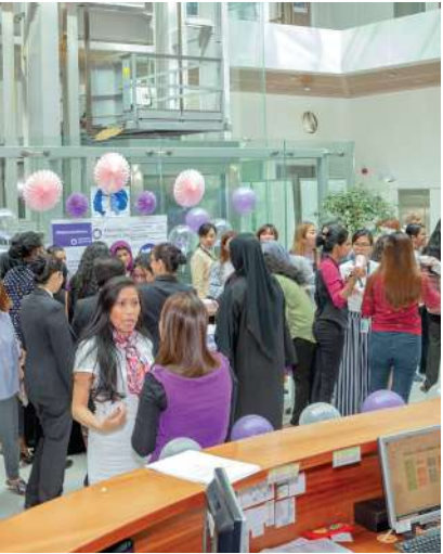
March - Serco-Group