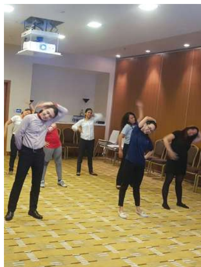
April: Novotel Dubai, Al Barsha