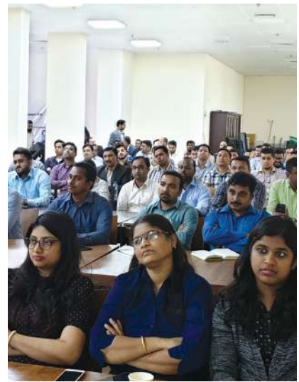
April: SKM Air Conditioning LLC