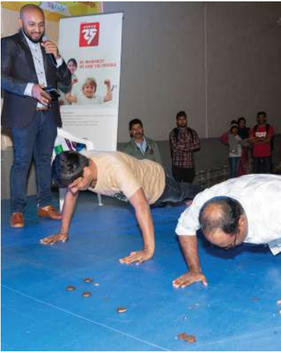
January: Road Show in association with Flowers FM at LULU Hyper Market, Al Qusias - Dubai

included health awareness talks by experts on various health care topics.