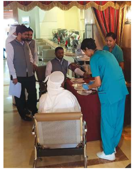
April: Real Estate