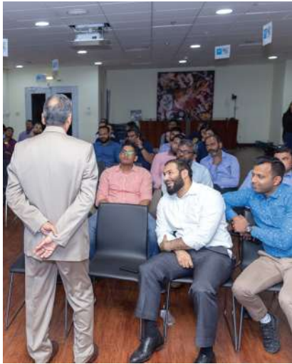
April - Khaleej Times