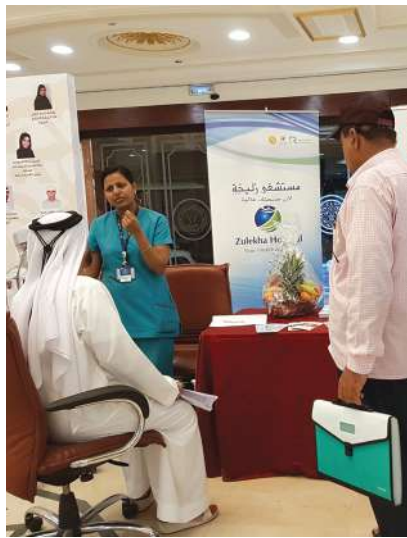
April: Sharjah Economic Development