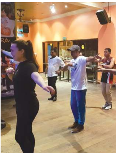
April: IBIS, Al Barsha