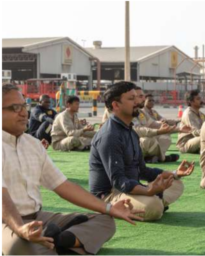
February: Emirates Gas