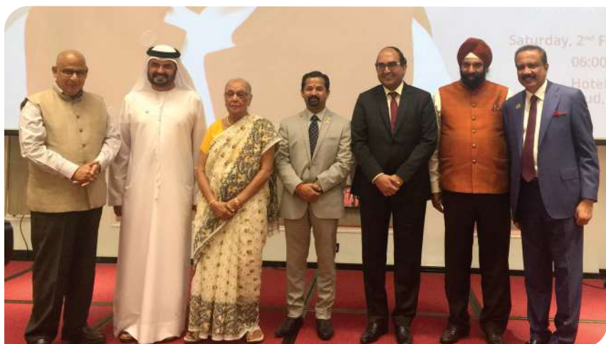
IBPC Dubai and valuable members of the organisation showed their appreciation and admiration for Founder and Chairperson,