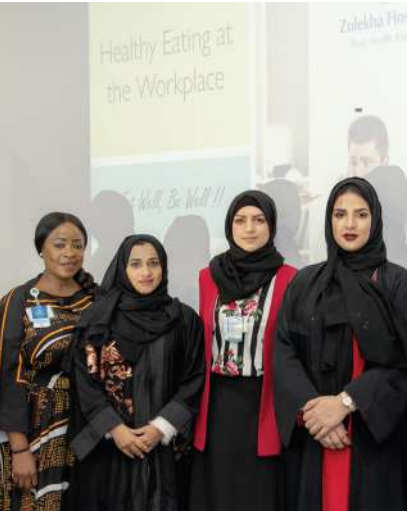
February: Federal Electricity and Water Authority